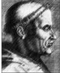
St. Thomas Aquinas

>>>> Priest, doctor of the Church, patron of all universities and of students. Born end of year 1226.