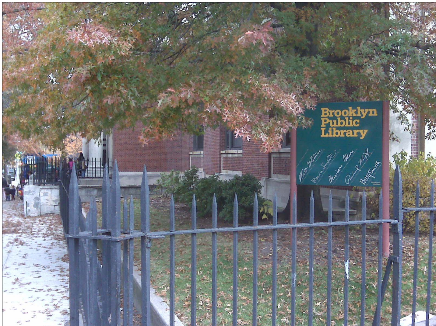
This will bring back memories.....now with a new sign....9 th street and 6 th avenue.