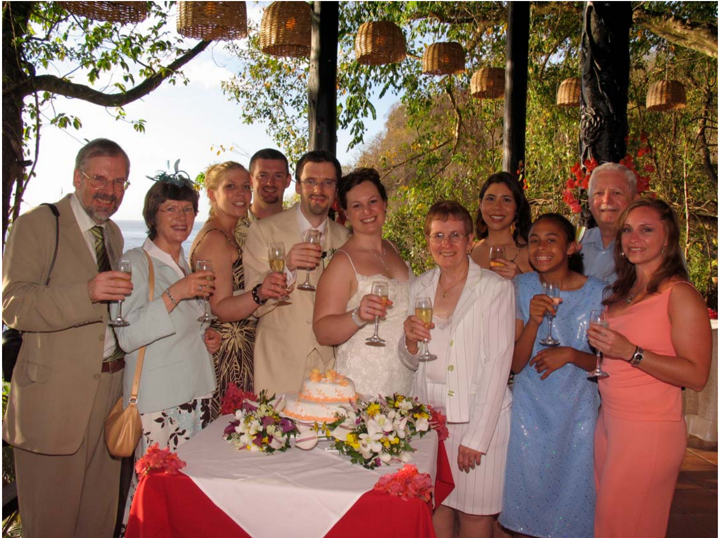
The whole clan.